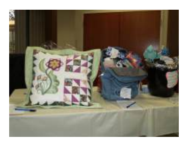
Homemade pillow, backpack with goodies