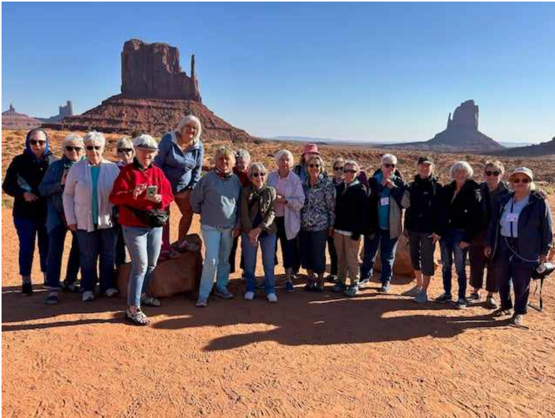
Southwest Studies travelers pause for a photo amidst the stark beauty of famed Monument Valley.