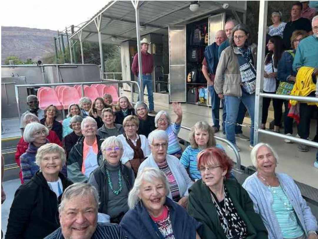
SW Studies gang ready to launch for an evening on the Colorado River.