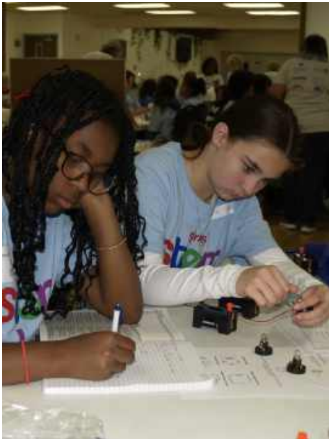
Electrical circuits students