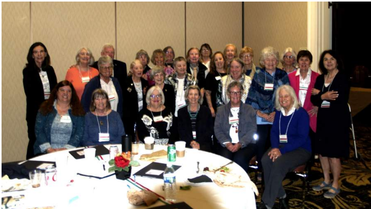
Just some of the Colorado Springs Branch attendees at the State Convention on Saturday