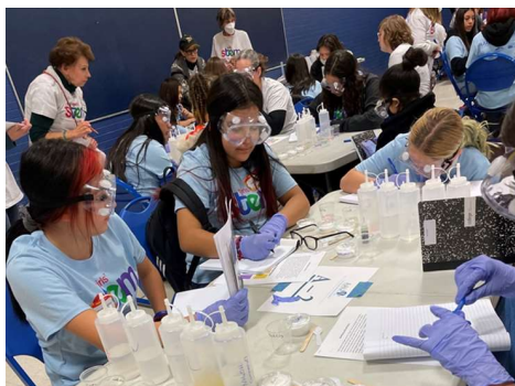
Chemistry experiment 2022