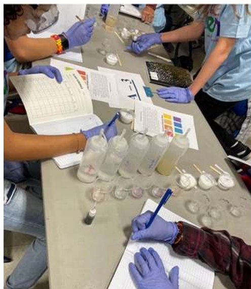
Chemistry Experiment 2022