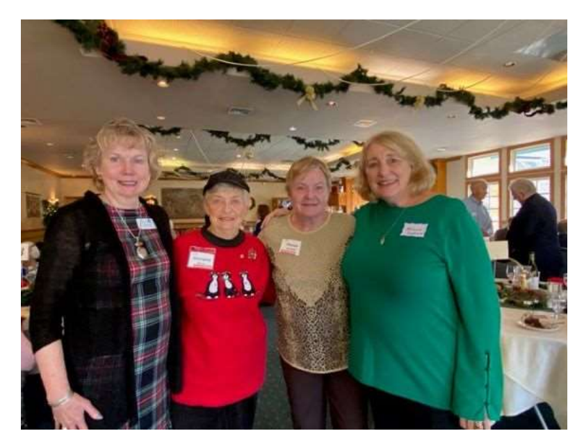
December Branch Meeting Attendees