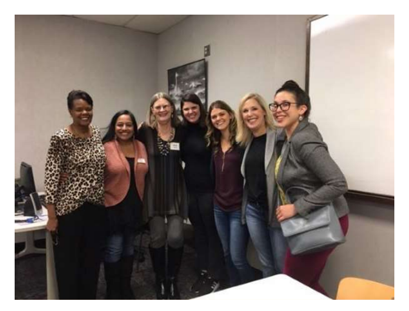
November Branch Meeting Discussion Panel