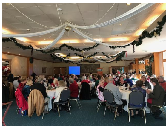
December Briarhurst Luncheon