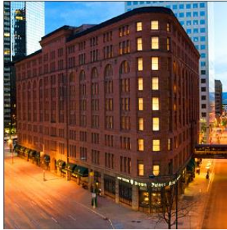
Private tour of The Brown Palace