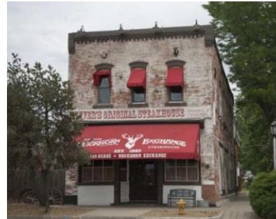
Lunch at the Buckhorn Exchange

On Aug. 12, 1892, The Brown Palace Hotel opened its doors in the heart of downtown Denver. The hotel has remained open and welcomed guests every minute of every day since opening.