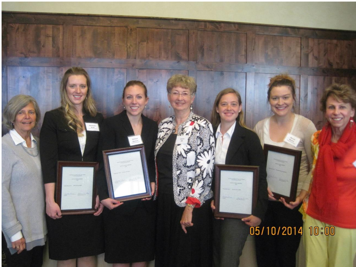
The Scholarship Committee with the Local Scholarship winners