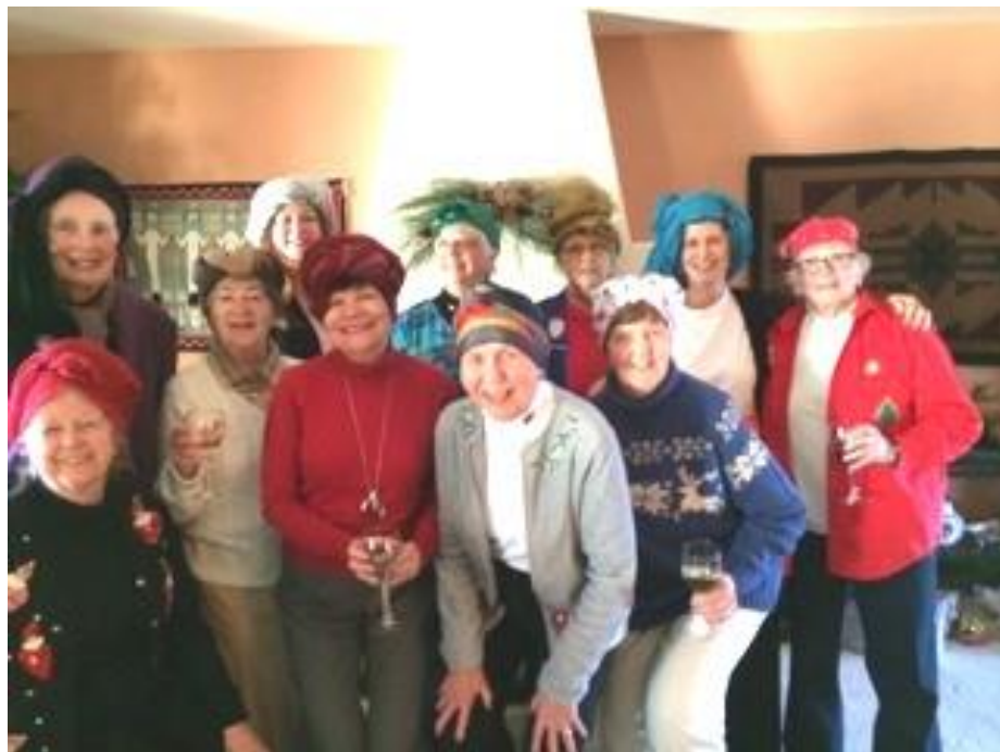
Luncheon Novel Too dressed as Cane River residents