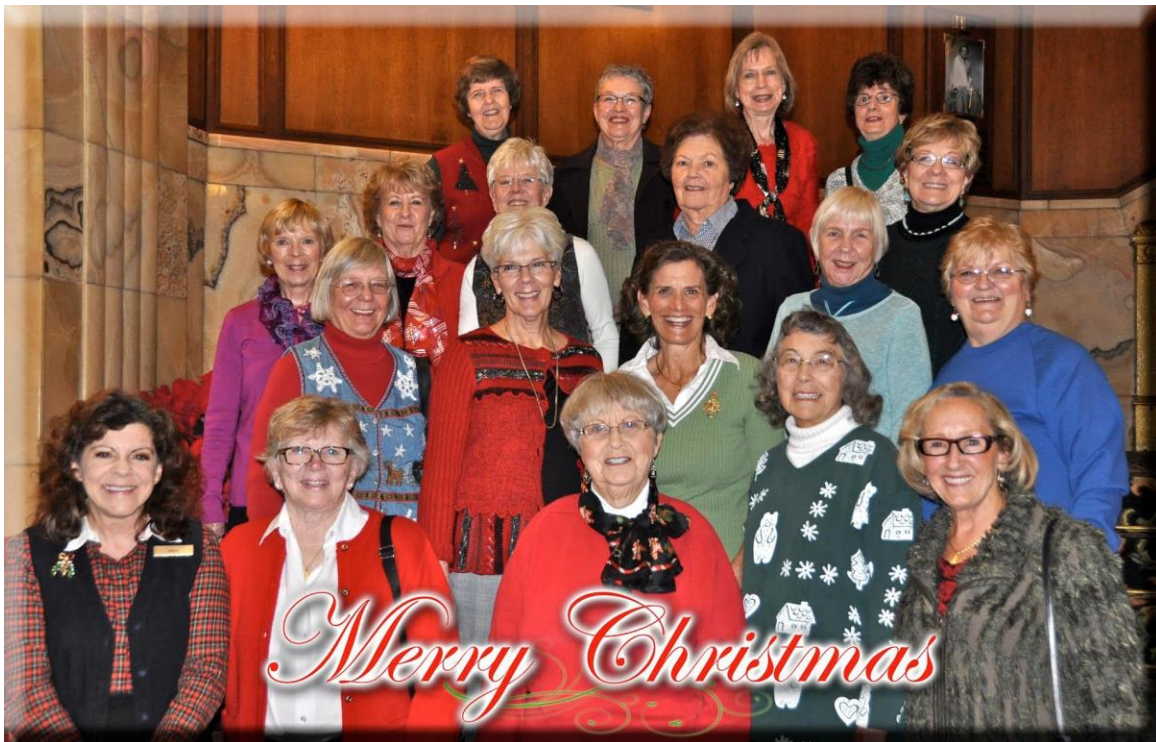
Local History at the Brown Palace in December