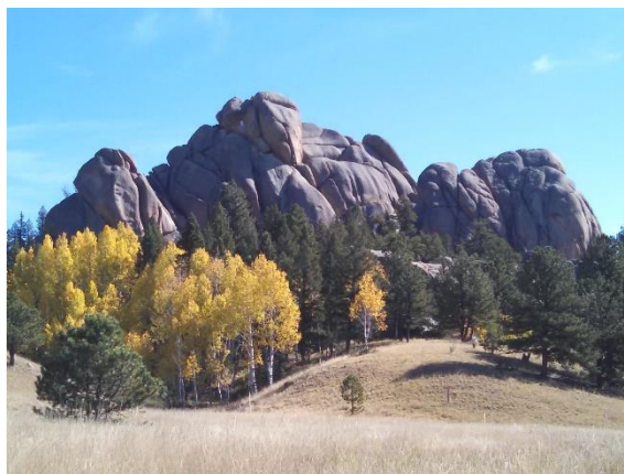
Scenes from the hike