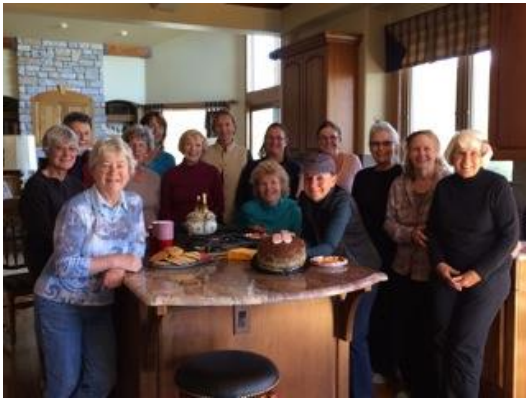
Hardy Hikers celebrate 20 th Anniversary