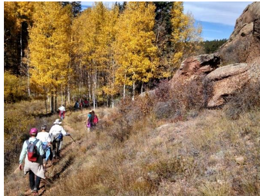
Hardy Hikers on October 6 th hike