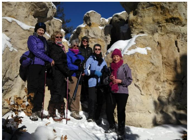
These 6 made it, plus photographer Suzanne Stahlbuhk