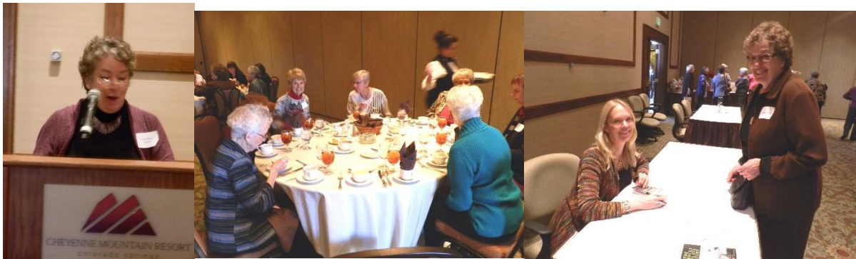
Author's Day was as wonderful experience for everyone- a. wonderful program and chance to meet our local authors