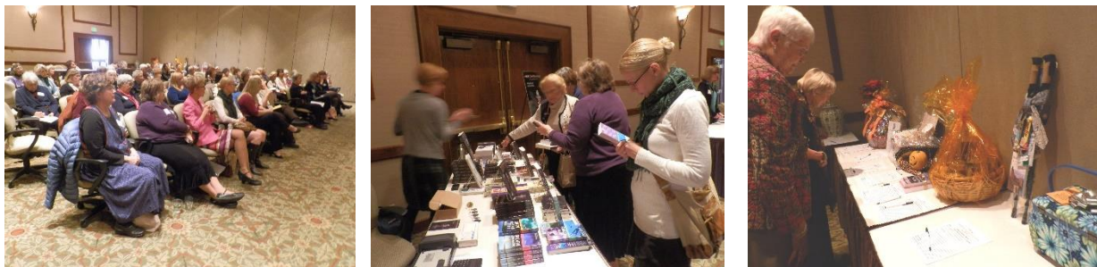
Next year plan to attend this really worthwhile event – and support our scholarship program