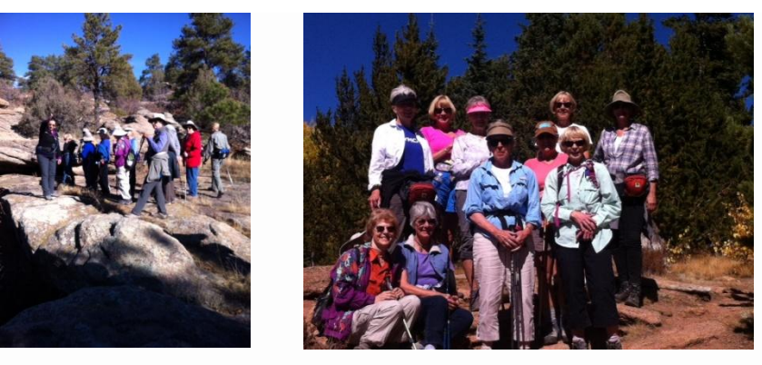
Hardy Hikers Hike Every Monday