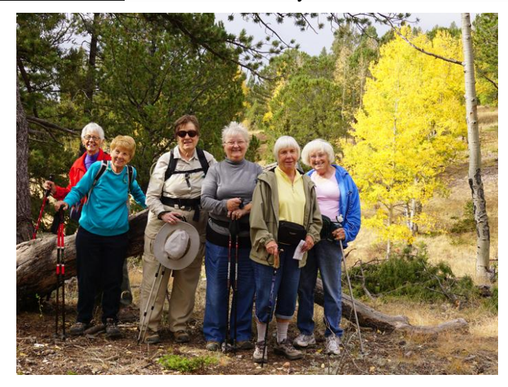
Amiable Amblers at Mueller State Park