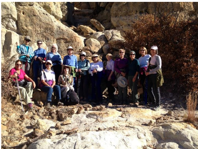
Hardy Hikers on the Cheyenne Trail in Palmer Park on Nov. 14, 2016.