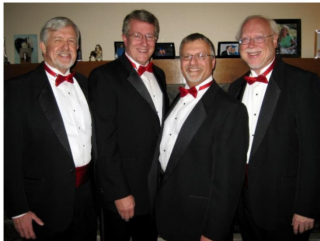
That Barbershop Style!