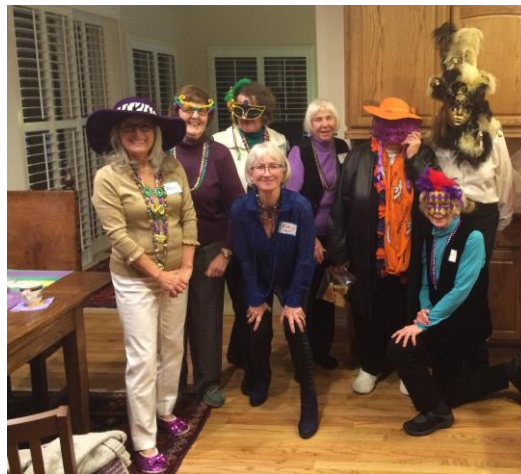
FOG Mardi Gras part